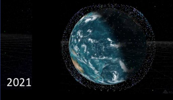
Illustration based on applications filed with the ITU and the U.S. FCC.

The recent, massive proliferation of commercial satellites in low earth orbit (LEO) significantly threatens astronomy unless mitigating actions are taken.